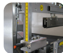
Safety photocell (optional) prevents cross seal bar from contacting the package